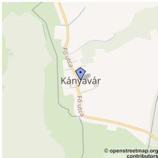
Village Info Kányavár